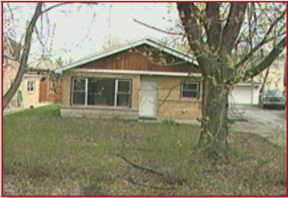
76 th Court