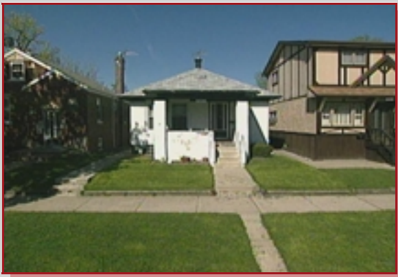
73 rd Avenue

2004 AV / Taxes 11,568 / $2,873 2005 AV / Taxes 15,659 / $2,691