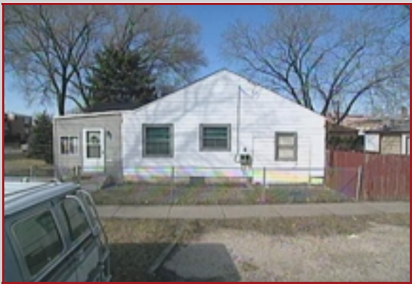
43 rd Avenue