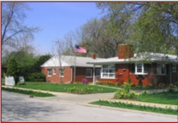
160 th Place

2004 AV / Taxes 16,050 / $4,327 2005 AV / Taxes 17,494 / $4,300