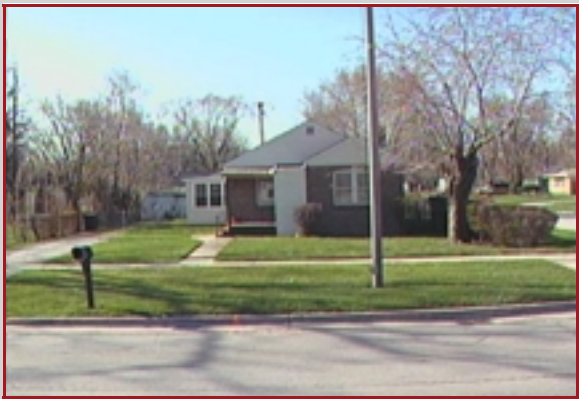
135 th Street