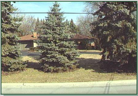
82 nd Court