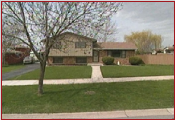
170 th Street

2004 AV / Taxes 16,787 / $3,142 2005 AV / Taxes 21,492 / $3,099