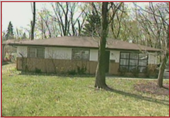
151 st Street