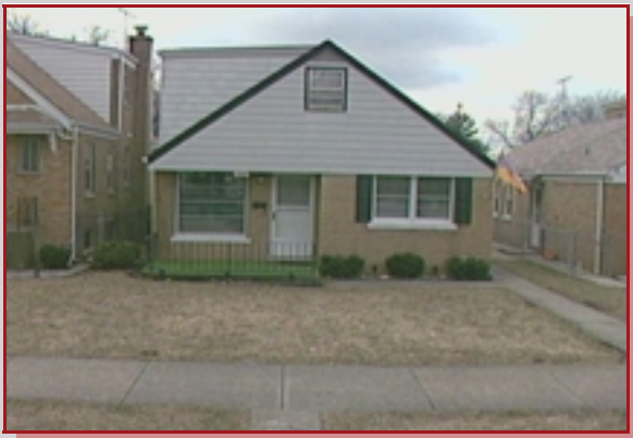
23 rd Avenue

2004 AV / Taxes 14,312 / $2,553 2005 AV / Taxes 19,734 / $2,430