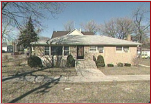
6 th Avenue

2004 AV / Taxes 11,492 / $3,320 2005 AV / Taxes 15,291 / $3,228