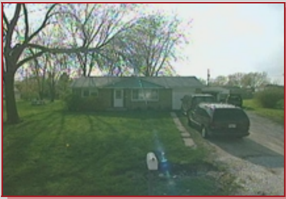
82 nd Court

2004 AV / Taxes 18,764 / $5,031 2005 AV / Taxes 24,010 / $4,514