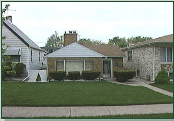
New England Avenue