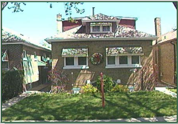
75 th Court

2003 AV / Taxes 18,005 / $3,752 2004 AV / Taxes 24,209 / $3,554