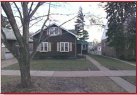
119 th Place