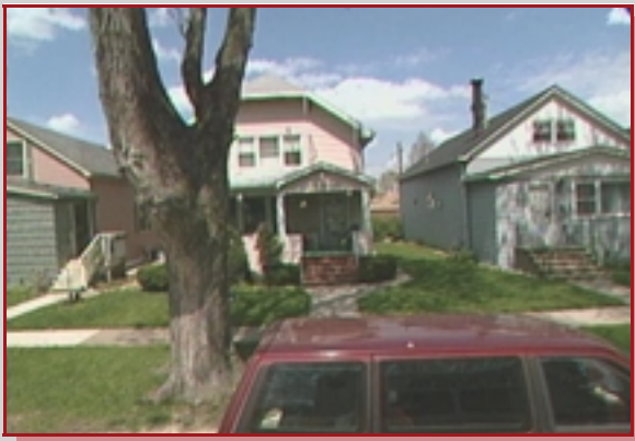
65 th Place

2004 AV / Taxes 14,554 / $3,693 2005 AV / Taxes 16,435 / $3,513